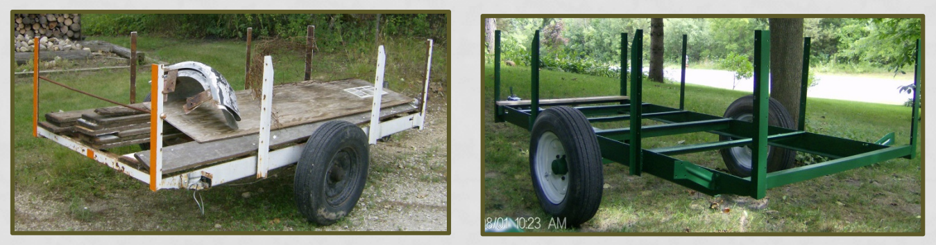
The floppy fenders were removed and most of the wood to expose the undercarriage. What a difference the perfect color of paint can make. Look at the wheels!!