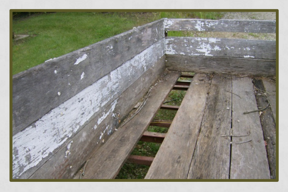
A sad state of affairs was our trailer as above.