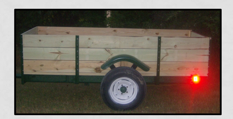
Lots of assembly required. And in the end, the piece de resistance, a shiny red light.