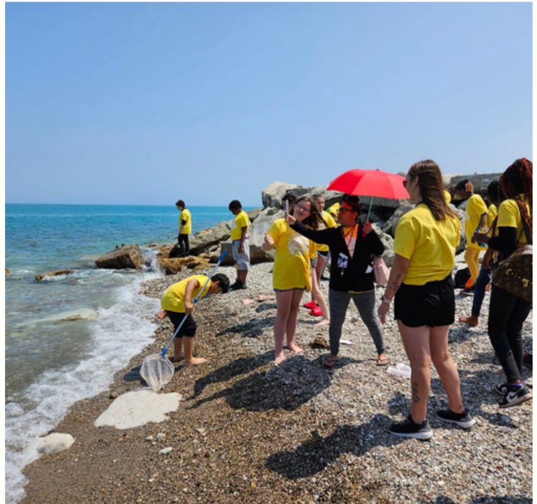
YMCA Summer Camp students along Lake Michigan's shoreline engaging in hands-on learning via our Discovering Nature program

Now more than ever, we are faced with the realities of climate change happening across our planet and in our own communities. We are witnessing first-hand the increased intensity of storms, floods, drought, wildfires, and sea level rising. On November 9, 2023, researchers with the nonprofit group Climate Central released a report that the last 12 months were the hottest in 150 years of recordkeeping, and probably in the last 125,000 years. The researchers' report shows from November 2022 through October 2023, the planet's average temperature was about 1.3 degrees Celsius higher than the average temperature from 1850 to 1900. As we are increasingly exposed to these difficult realities, many of us can experience anxiety and grief for the future of our planet.