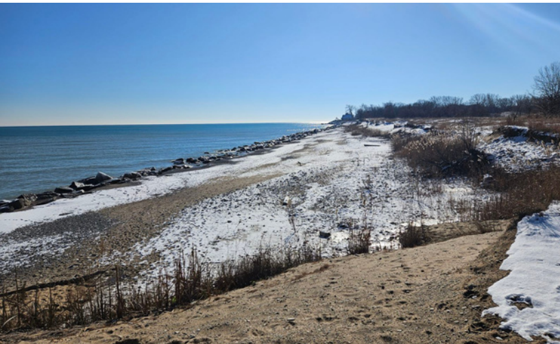
Erosion at the Kenosha Dunes

Many of us in Southeast Wisconsin have enjoyed the warmer days we've been experiencing this fall. However, these warmer temperatures are detrimental to coastal communities across the Great Lakes. Ice cover on the Great Lakes is forming later, melting sooner, or not forming at all causing huge waves to make it to the shoreline. The lack of ice combined with high-water levels allow erosive waves to reach higher elevations on the shore, accelerating shoreline recession, beach loss and bluff failures.